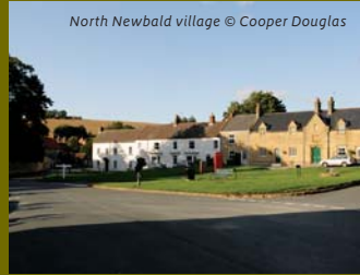
North Newbald village

Across the narrower southern end of the Wolds from the medieval market town of Beverley to the attractive limestone village of North Newbald, with its large green, Norman church and pubs. There are superb views over the Vale of the York as you crest the Wolds western escarpment. Beverley Minster (built 1230-1490) is an outstanding example of Gothic architecture and a prominent landmark to orientate yourself by. Beverley is on the Yorkshire Coast railway line.