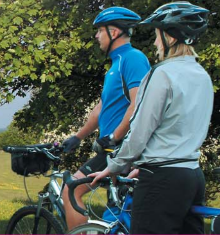
The Minster from Beverley Westward

Map © Crown Copyright 2010. All rights reserved. Licence 0100031673