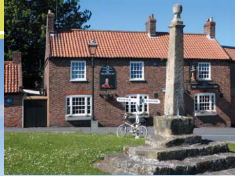
The village green at Lund